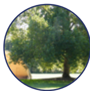
Platanus x acerifolia (London Plane).