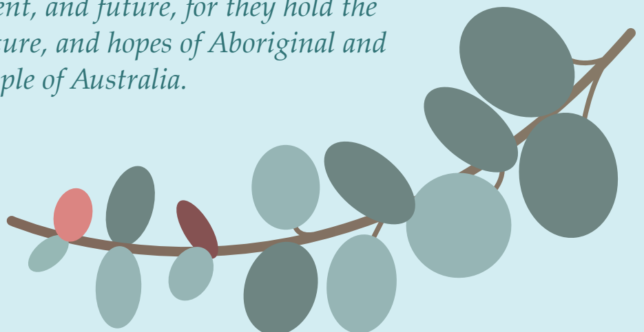
eucalyptus, (genus Eucalyptus)

We acknowledge the Bunurong and Gunaikurnai people as the Traditional Custodians of South Gippsland and pay respect to their Elders, past, present, and future, for they hold the memories, traditions, culture, and hopes of Aboriginal and Torres Strait Islander people of Australia.