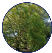
Platanus orientalis (Oriental Plane)

There are three National Trust-registered trees in Mossvale Park, planted in the late 1800s by the Moss Vale Nursery Managers: