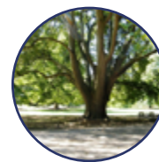
Quercus castaneifolia (Chestnut-Leaved Oak).